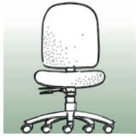
5-prong base Medium back