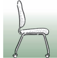
4-legged base Medium back