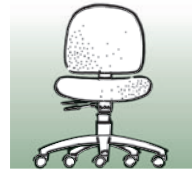
5-prong base Low back