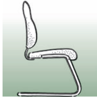
Sled base Medium back