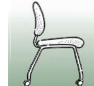
4-legged base Low back