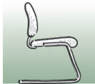
Sled base Low back