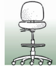
5-prong base Designer stool